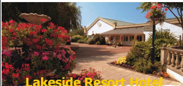
Lakeside Resort Hotel